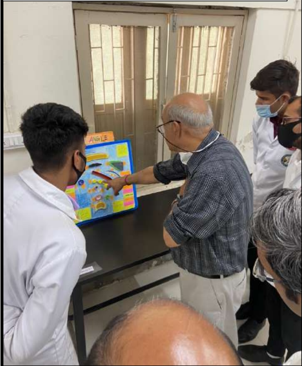
The Executive Director Sir interacting with the students