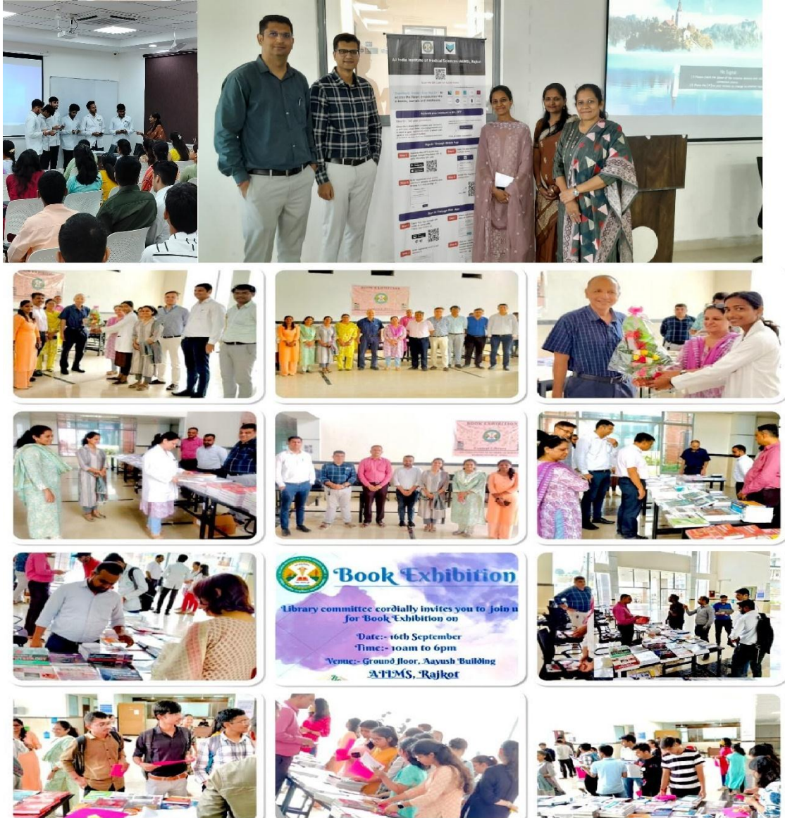
Orientation of library, exhibition of books and training of students to use online institutional Library resource