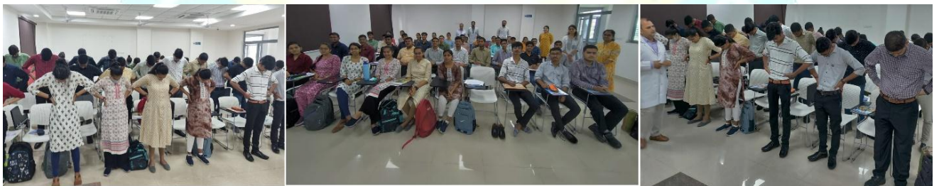
Coping stress management : Yoga and physical activity