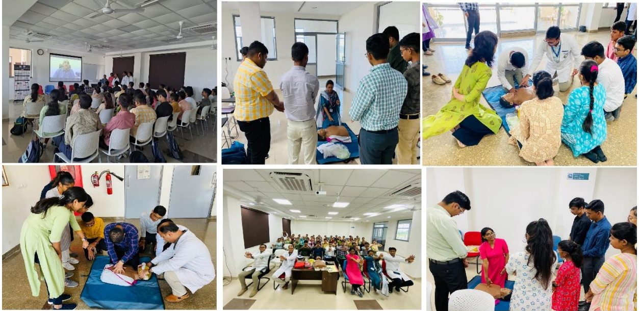
Hands on workshop: Basic life support training

The Foundation course was well received and appreciated by the students.