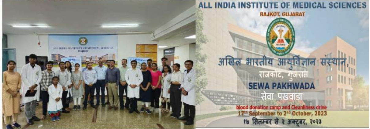
Role play presented by AIIMS Rajkot students for the Organ Donation Awareness on 27th September, 2023