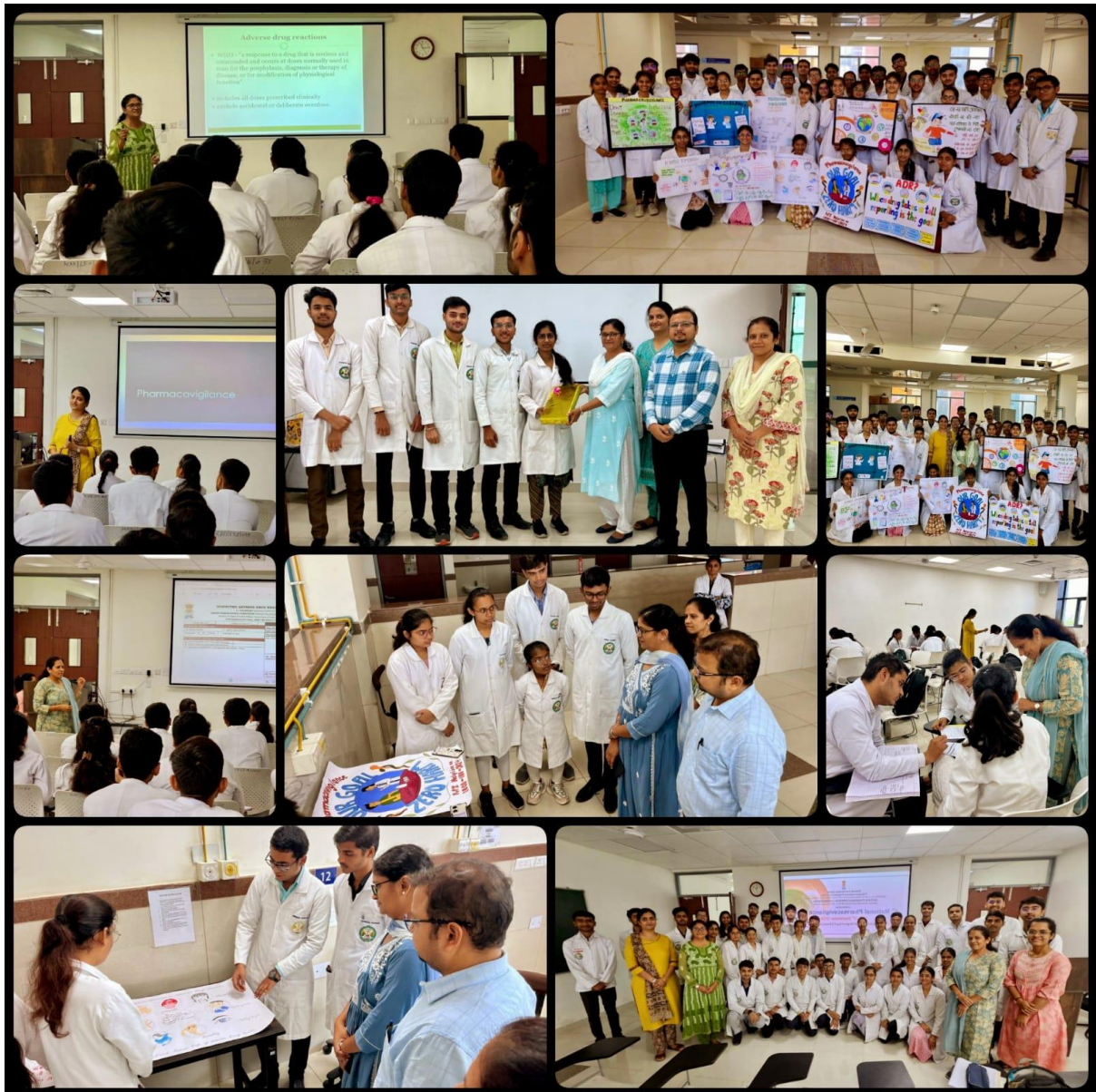
Photographs of the “National Pharmacovigilance Week Celebration” at AIIMS Rajkot (17-23 Sept, 2024)