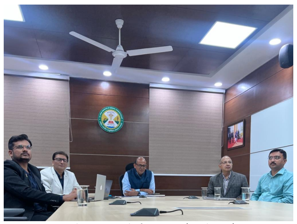
Welcome remarks from Dean (Academics)