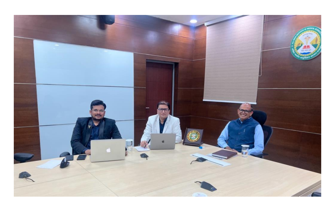
Organising Team, Department of FMT, AIIMS Rajkot